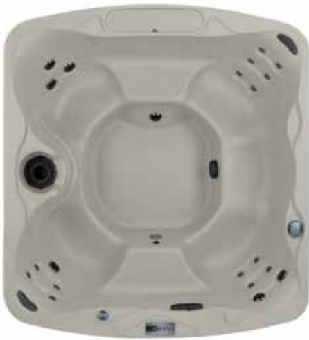
Monterey shown in Sand