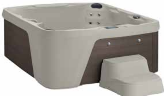
Monterey shown in Sand / Brown with built-in ice bucket